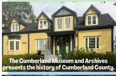
The Cumberland Museum and Archives presents the history of Cumberland County.