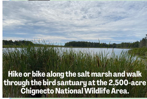
Hike or bike along the salt marsh and walk through the bird sanctuary at the 2,500-acre Chignecto National Wildlife Area.