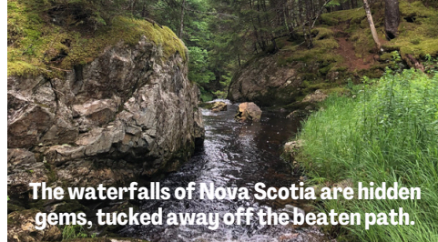
The waterfalls of Nova Scotia are hidden gems, tucked away off the beaten path.