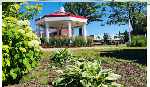
Victoria Square is at the centre of downtown Amherst and the site of the cenotaph.