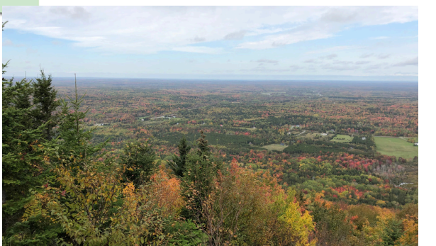
The views from the trails in Ski Wentworth are particularly beautiful in the fall.