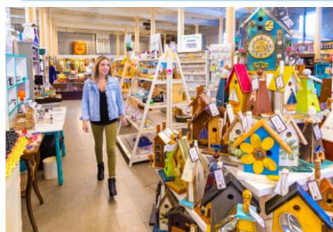
Amherst offers many unique shopping experiences like the shops inside Dayle's Grand Market, 129 Victoria St. E.