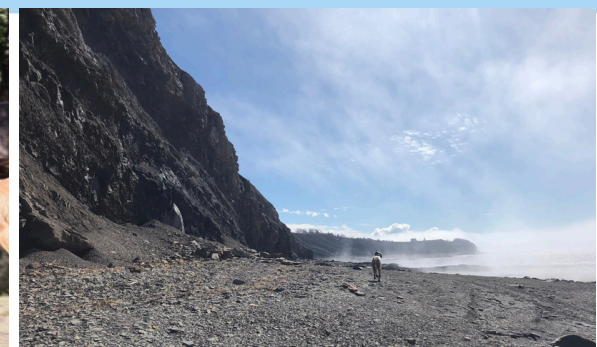
Explore the beach at Joggins, N.S. and look for fossils! Be sure to watch out for the rising tide.