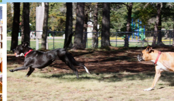
Amherst's off-leash dog park is the perfect pit stop! Located at 132 E. Pleasant St. in Dickey Park!